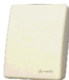
\epsilon SENSE IP30 wall housing without display

\epsilon SENSE helps you save money by decreasing your energy consumption while creating a healthier indoor climate!