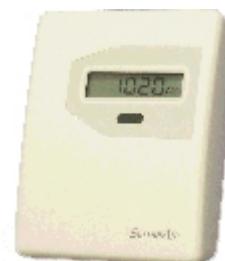
\epsilon SENSE-D IP30 wall housing with display