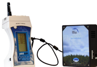
YES AIR attached to a remote particulate sensor, YES DUST.